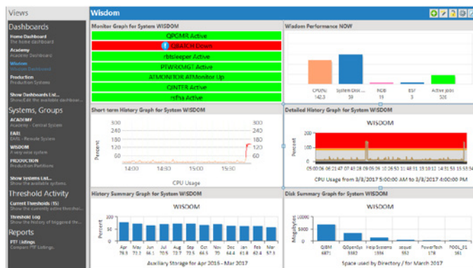
The modern, intuitive dashboard in Robot Monitor improves visibility and connects performance data, making it more digestible.